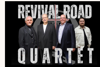
MUSICAL GUEST Revival Road Quartet Southern Gospel quartet from Greenwood, Indiana